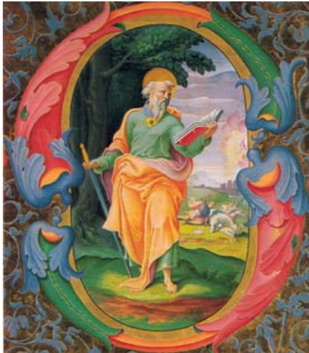
Miniature of St. Paul

Therefore, Paul is not just any apostle: he is an apostle with “all his papers in order,” that is, he has been given a specific mission: to go to the Gentiles, those farthest away from God (Rm. 11:13). For a Jew, who could not comprehend a mission outside his own land, this was an astounding assignment.